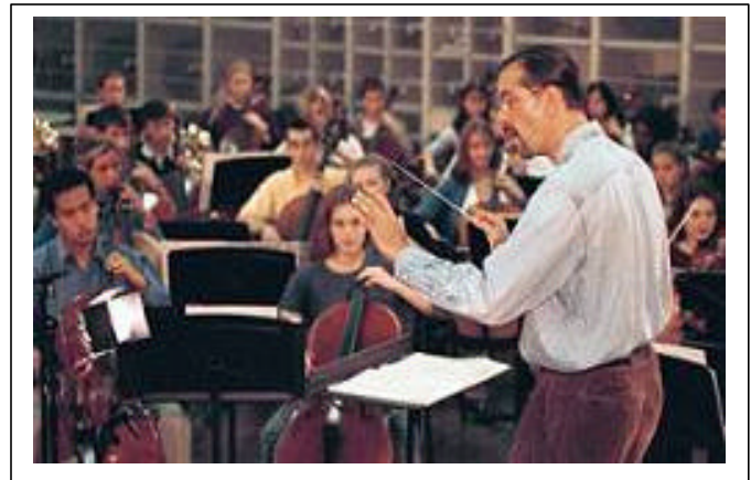
The Louisville Youth Orchestra performs The Storm .